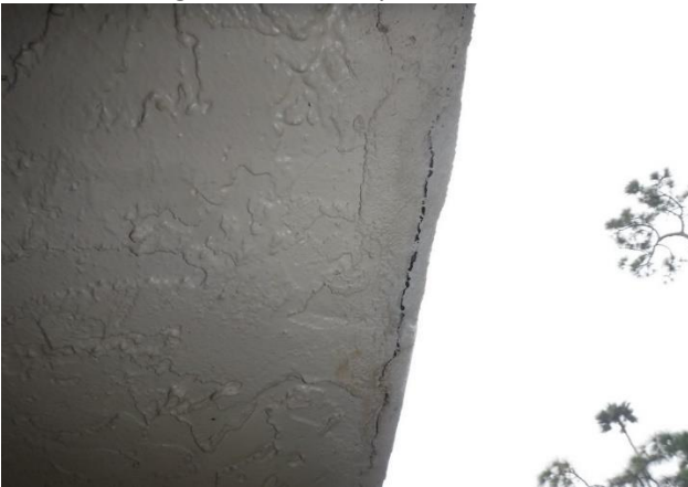
13 Area of Moisture Damage and cracking at Railing on the Balcony of unit # 115