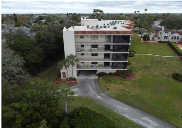
3 Rear of Building #502