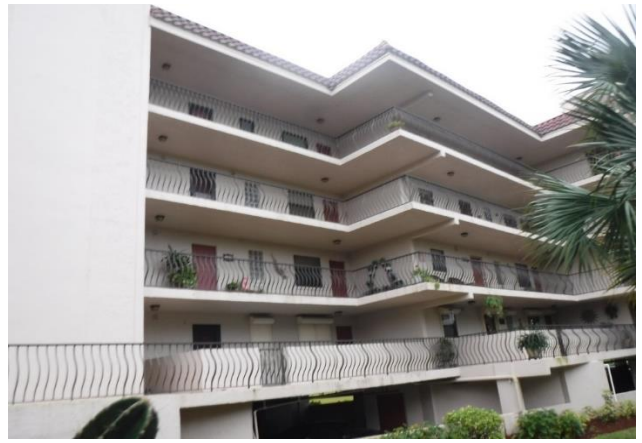
2 Right Side of Building #502