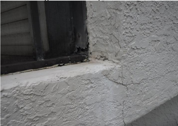
11 Area of Moisture Damage and cracking at Railing on the Balcony of unit # 115