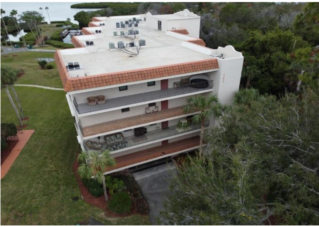
1 Front of Building #502