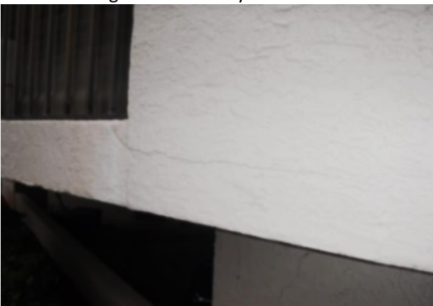
15 Area of Moisture Damage and cracking at Framed, Stucco wall of unit # 115