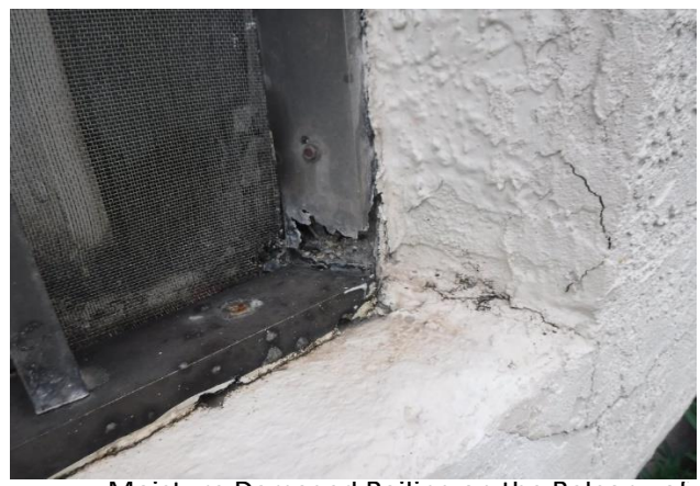
10 Moisture Damaged Railing on the Balcony of unit # 115