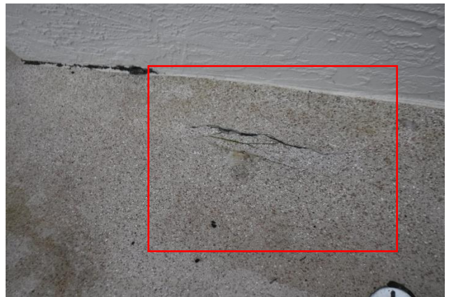
6 Building #502 Damaged Walkway Coating near unit #115