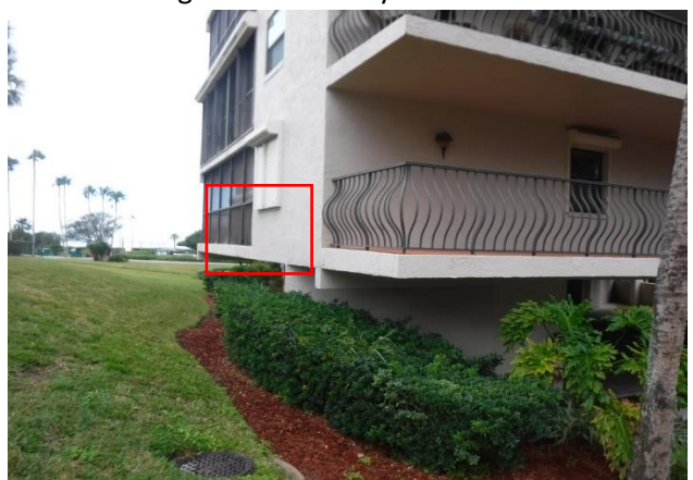
16 Area of Moisture Damage and cracking at Railing on the Balcony of unit # 115