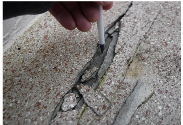
8 Building #502 Damaged Walkway Coating near unit #115