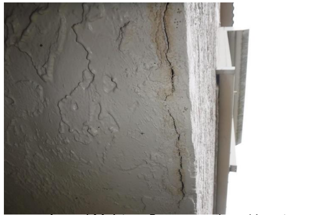
14 Area of Moisture Damage and cracking at Railing on the Balcony of unit # 115