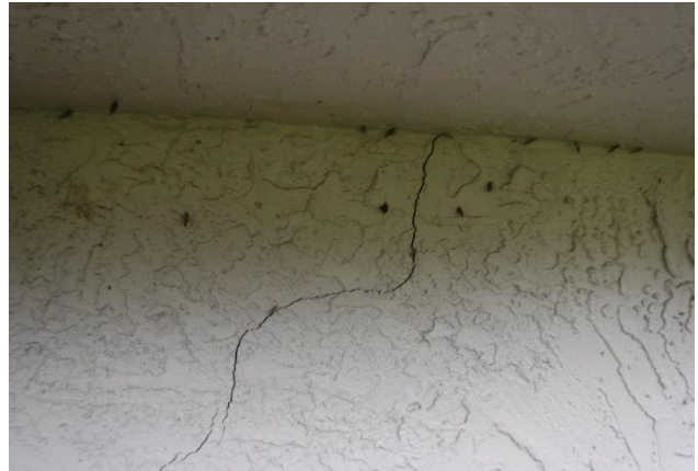
12 Area of step cracking at CMU's rear side of unit # 115