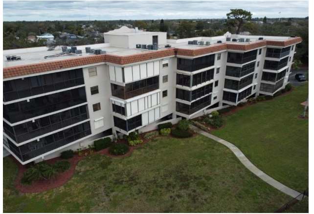
4 Left Side of Building #502