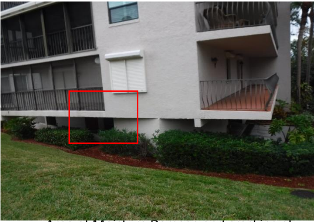
9 Area of Moisture Damage and cracking at Railing on the Balcony of unit # 115