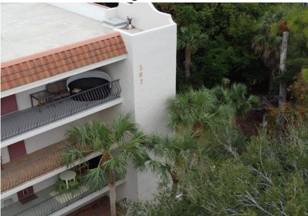
5 Building #502